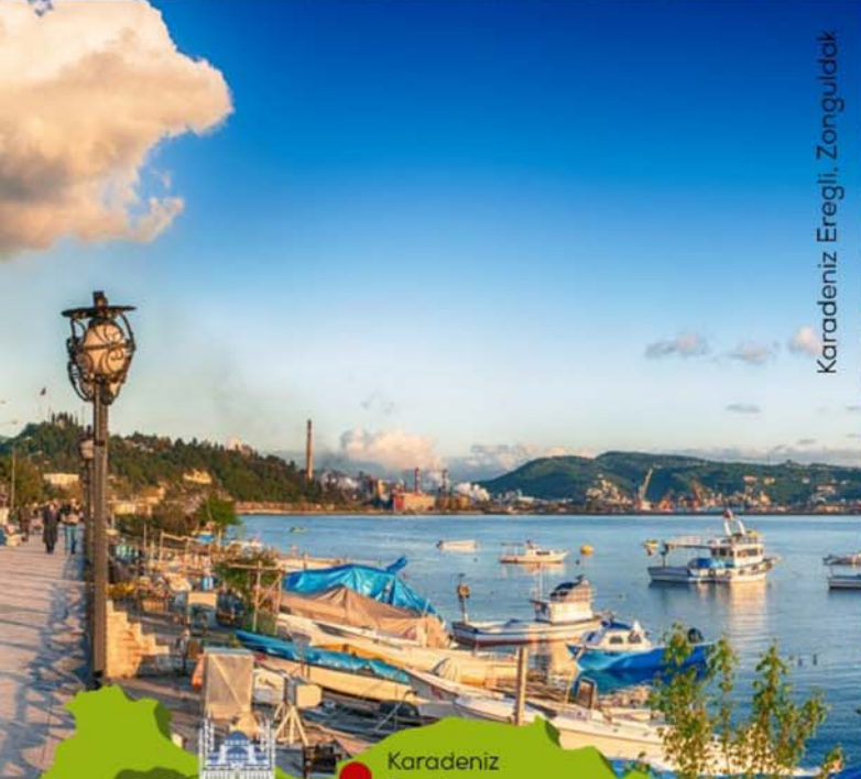
Karadeniz Ereğli, Zonguldak